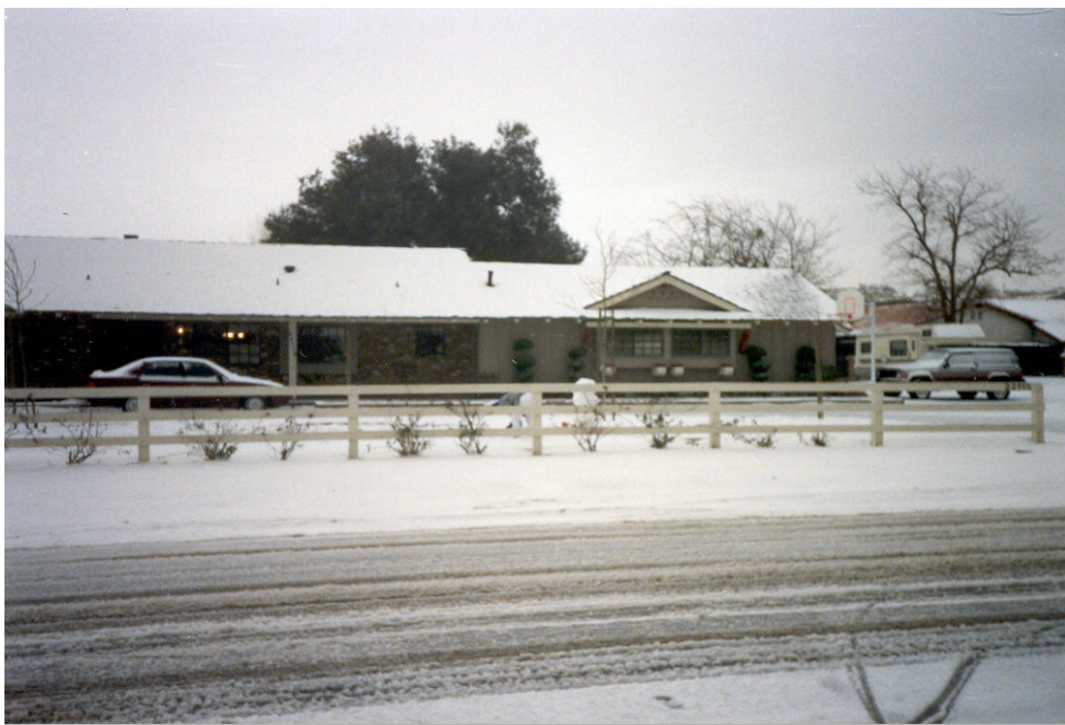
Snow on Placeritos in 1988 - Photo by Del Nelson