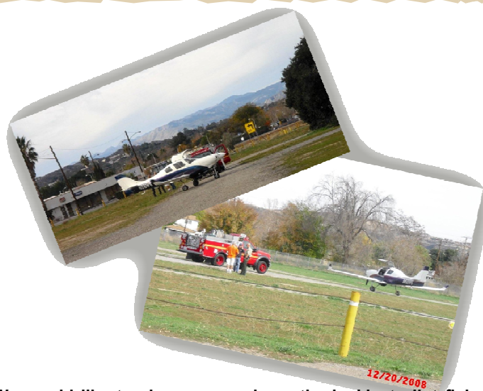
We would like to show you perhaps the luckiest pilot flying on December 20, 2009. Although he didn't land in the Hudson River, he did find a nice long flat area on the old Glaser Property on which he was able to land after losing power over Newhall Pass!