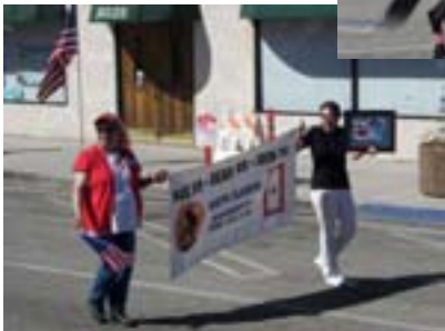
Placerita Canyon was well represented in the Fourth of July Parade in Downtown Newhall... Way to go guys!